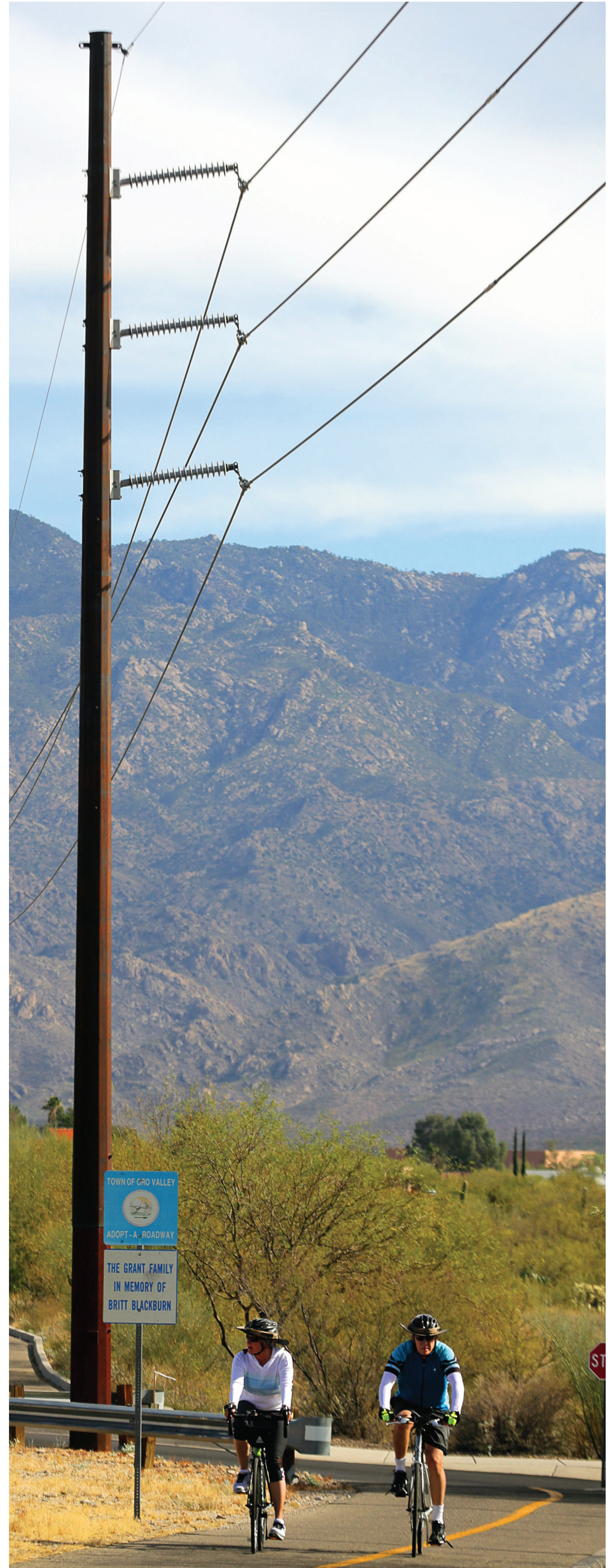
A typical weathering steel monopole supporting a 138 kilovolt transmission line