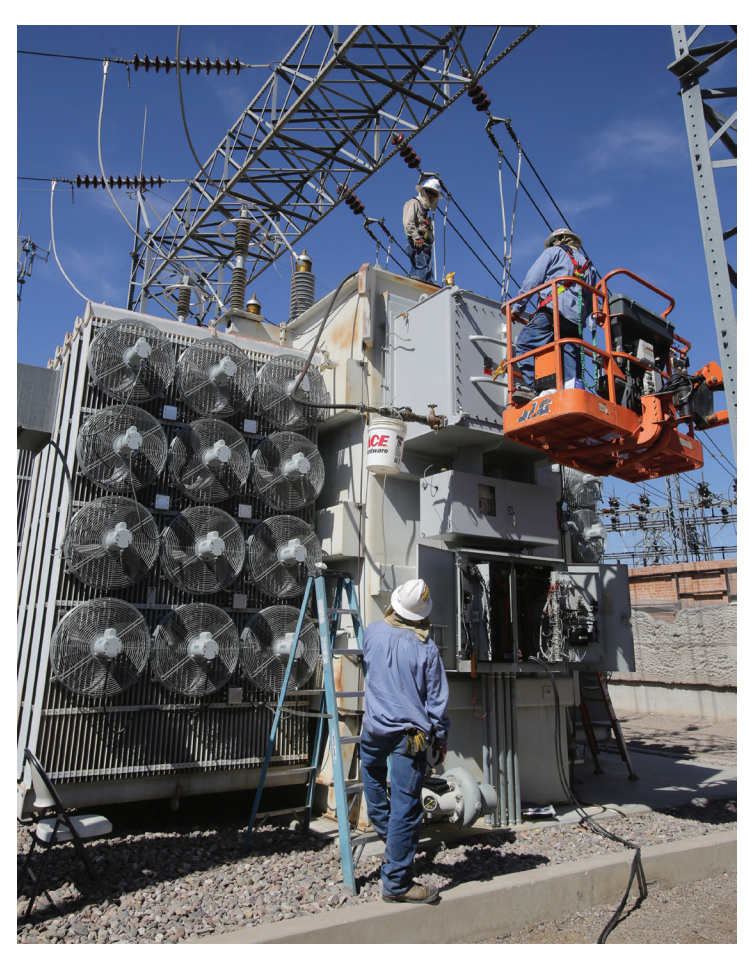
TEP employees install upgrades at the East Loop substation.