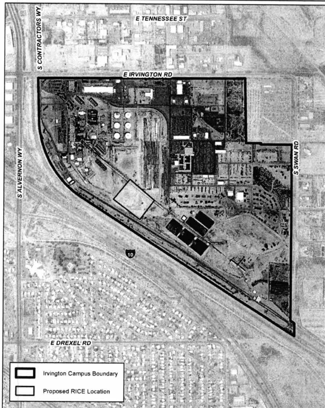
Exhibit A - RICE Project