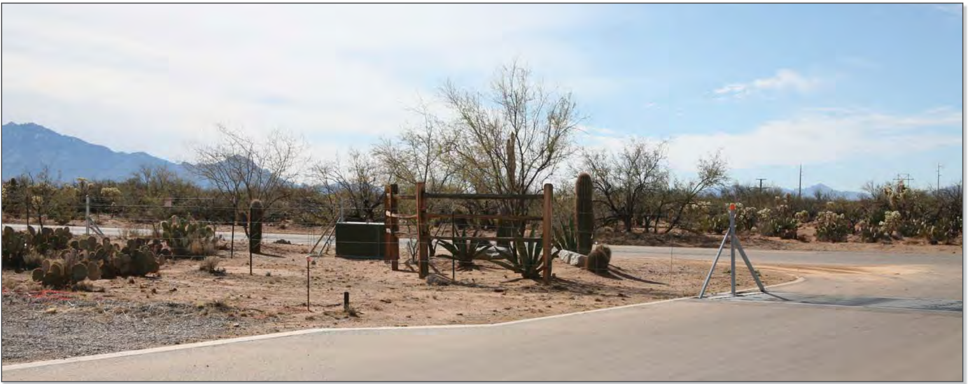
Existing Condition – Sahuarita Highlands residences along East Broadwater Way, Santa Rita Road, and Santa Rita Mountains