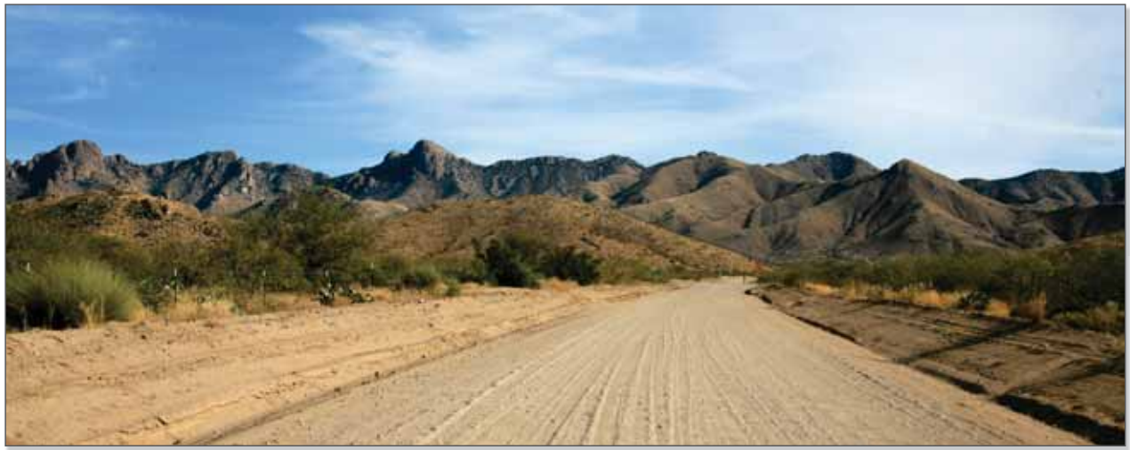
Existing Condition – Santa Rita Road within the Santa Rita Experimental Range