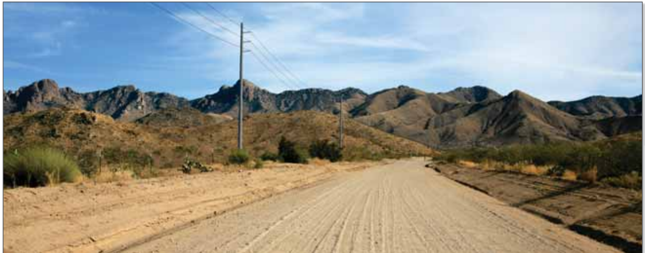
Simulated Condition – Proposed 138kV galvanized steel single-circuit transmission lines and water pipeline with shared access road