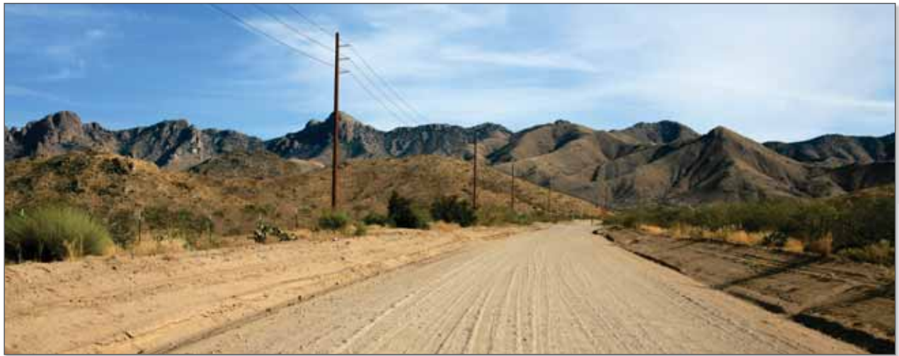
Simulated Condition – Proposed 138kV corten steel single-circuit transmission lines and water pipeline with shared access road