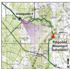
Photograph Location: Santa Rita Road Route facing southeast on Santa Rita Road.