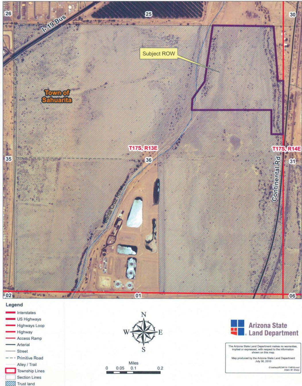
Exhibit H-2. Responses to Agency Letter